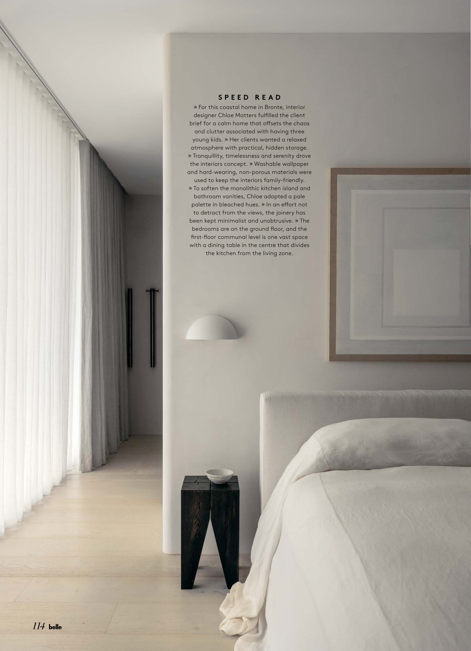
This page, clockwise from top The kids’ bunk room features a misty blue palette. The bed frames are built in and have been painted Porter’s Paints ‘Duck Egg’. Bed Threads bedding. Toogood ‘Roly-Poly’ chair from District. Window coverings are Mokum ‘Obi’ in Duckegg. Wall sconces from Lighting Collective. A Pierre Jeanneret ‘Easy’ chair from Studio Hacienda sits in the corner of the calm master bedroom. Custom-made bedhead with bedding by Elias Mercantile. In the walk-in wardrobe there is central island with a leather top lined in Laguna Cypress from NSW Leather Co. Pot by Watertiger and breakfast bowl by Timna Taylor from The DEA Store. Opposite page The ensuite is behind the bullnose bedhead wall. Sconce from Lighting Collective. Artwork by Danica Firulovic. ‘Backenzahn’ side table from Living Edge.

No matter whose hands are getting dirty, the interiors can withstand hard knocks and clutter, despite its clean canvas. At once soothing and robust, it’s a house that has it all. 15 mattersandmade.com